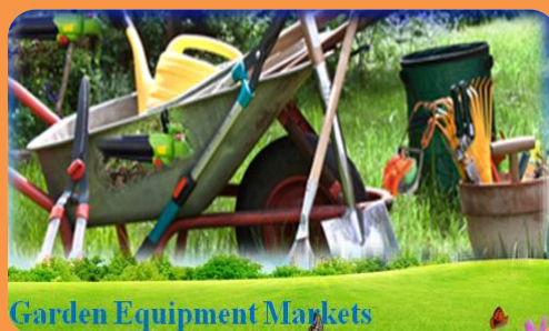
Garden Equipment Markets